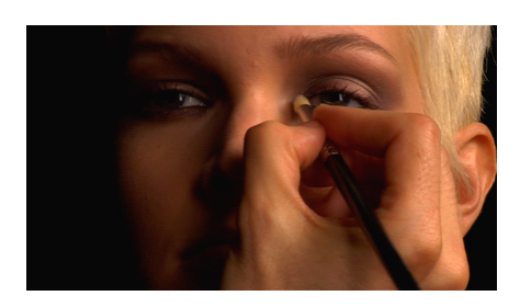
STEP 9 0F 9 Brush brows in place with clear brow gel.

Eye Shadow – Woodwinked 219 Pencil Brush