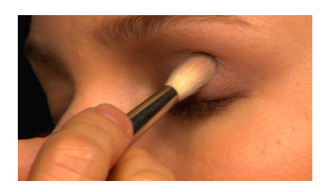
STEP 5 OF 9

Eye Shadow – Smut 228 Mini Shader Brush 222 Tapered Blending